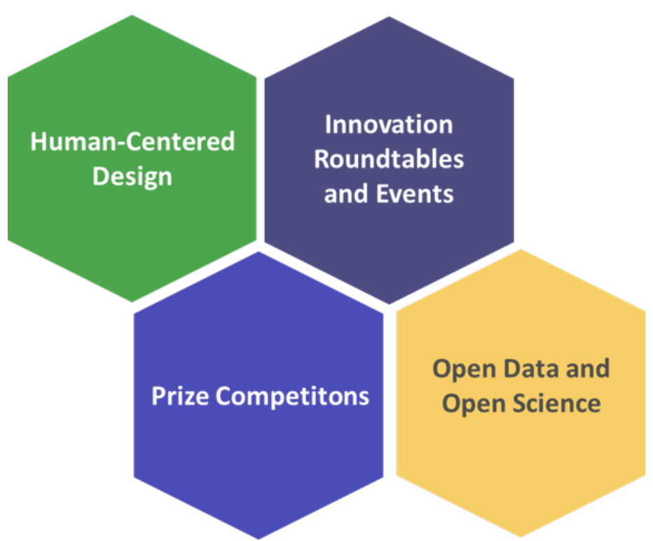
Figure 4. Lyme Innovation Methods.