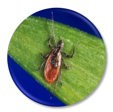
Figure 2. Blacklegged Tick.

The HHS Lyme Innovation Initiative and LymeX Partnership aim to (1) signal HHS interest in Lyme disease; (2) encourage all sectors and U.S. markets to engage in Lyme disease; (3) expand the solution space and engage new solvers by reaching wide communities of experts who may have solutions but have not yet applied their expertise to Lyme disease; (4) accelerate the pace of Lyme disease science and diagnostic technologies; (5) raise public awareness of Lyme disease and to improve disease prevention; (6) harness the power of the crowd through crowdsourcing, citizen science, and "open" methods to create solutions using creation best practices<sup>21</sup>.