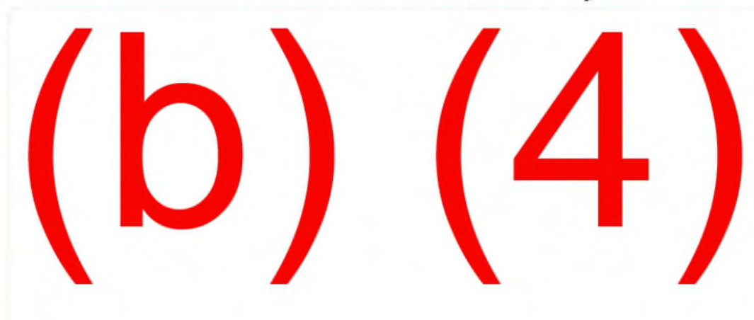
Table 2. Test Scheme for Study 4