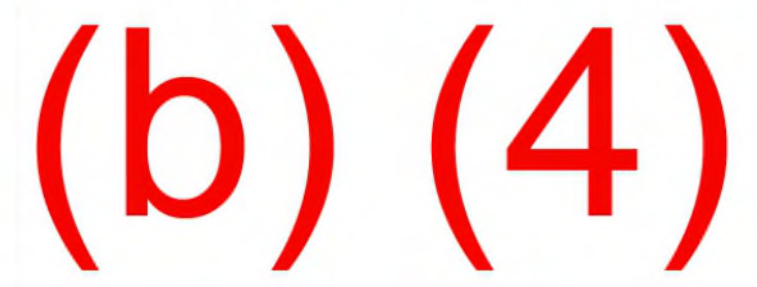
Table 3. Test Scheme for Study 5

A series of contrived specimens will be prepared using NP swab specimens collected from negative donors and stored in one of three media formulations (Table 3). Five donor NP samples will be collected per media formulation, and NP media from each sample will be tested in three preparations: unspiked, spiked with live virus at 1X LoD, and spiked with live virus at 5X LoD.