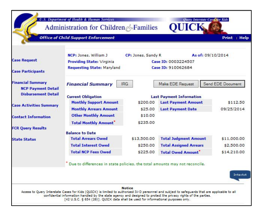
Figure 7-1: Financial Summary Window

The Financial Summary window, shown in Figure 7-1, displays a group of elements that gives an overview of the current obligation, last payment, and balances owed. (The system displays the data exactly as supplied by the responding state.)