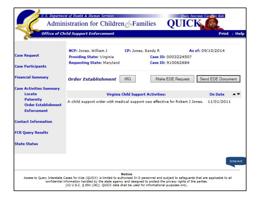
Figure 8-4: Order Establishment Window

The Order Establishment window, shown in Figure 8-4, lists the most recent activities to establish a support order.