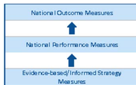
Figure 2. Performance Measure Framework

The NPMs are a set of short-term and medium-term performance measures that utilize population-based, state-level data derived from national data sources and for which a