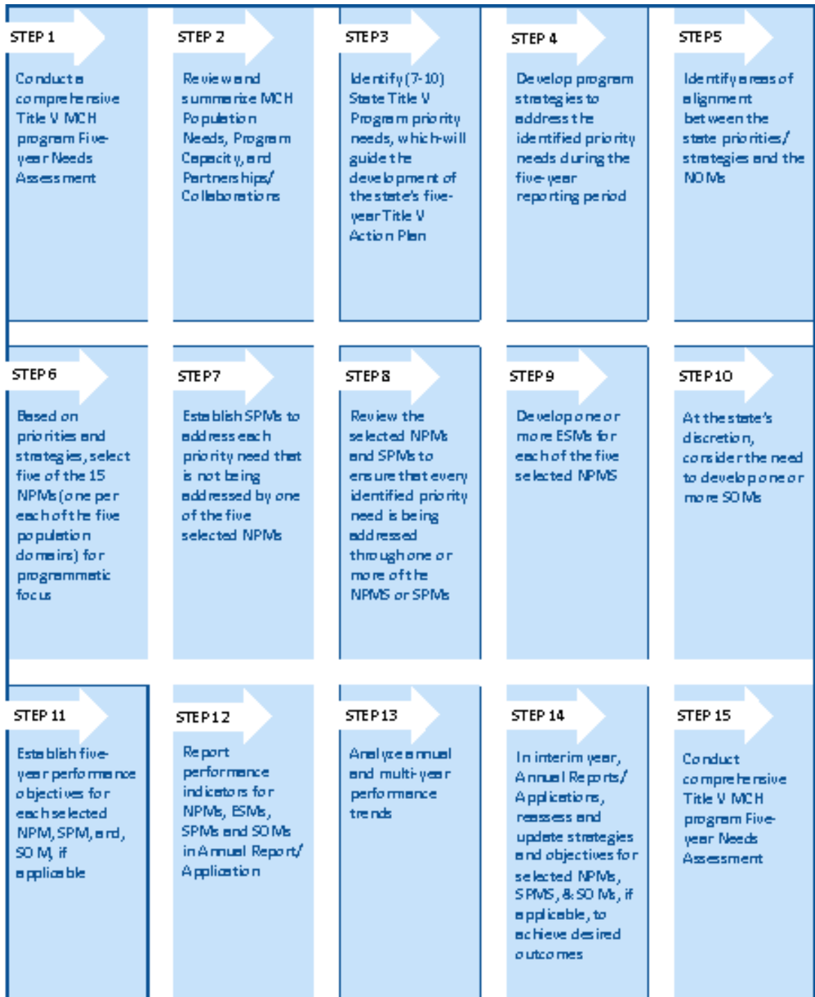
Figure 4. MCH Block Grant Logic Model

The state begins each five-year cycle by conducting a comprehensive Title V Five-Year Needs Assessment. This Needs Assessment includes a comprehensive review of MCH population needs, program capacity, and partnerships/collaborations that are critical