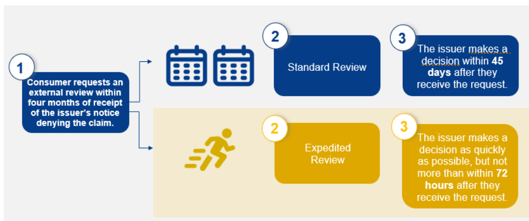
Exhibit 7 - External Review Process

Standard external reviews are decided as soon as possible, but no later than 45 days after the request was received. Expedited external reviews are decided as soon as possible, but no later than 72 hours depending on the medical urgency of the case, after the request was received. Exhibit 7 summarizes the external review process.