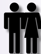
Men &amp; women